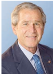
George W. Bush Former President of the United States