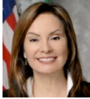
Rosa "Rosie" Gumataotao Rios Treasurer of the United States