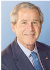
George W. Bush 43rd President of the United States and Founder of the George W. Bush Foundation